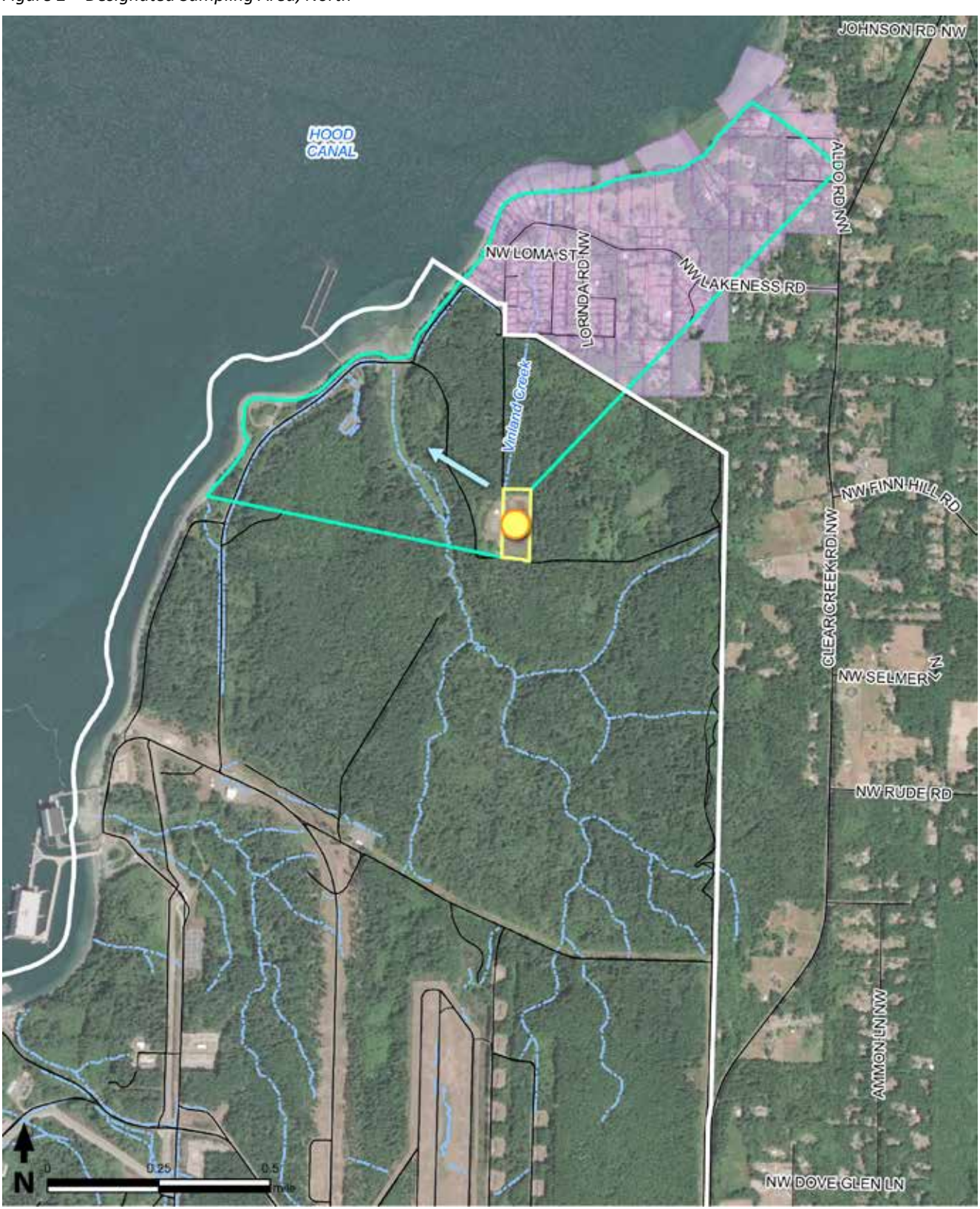
Figure 2 – Designated Sampling Area, North