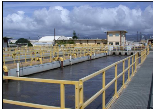
Right - Aeration/ Anoxic Tanks