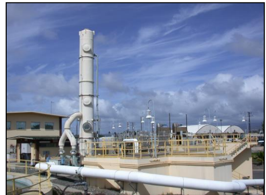
Headworks (above) with Odor Reduction Biofilters (below).