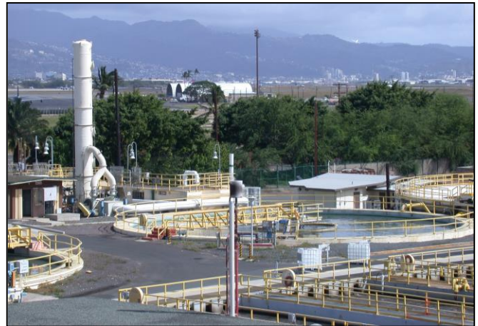
Headworks and Primary Clarifier

The facility covers approximately 4.7 hectares (ha) of land or 11.61 acres and accepts both domestic (household) and industrial wastewater. It provides advanced secondary treatment through the use of clarifiers, an activated sludge process, and effluent filtration for approximately 6.5 million gallons of wastewater per day.