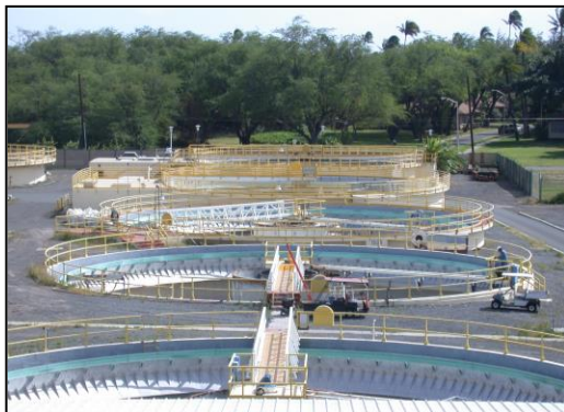
Left - Secondary Clarifiers