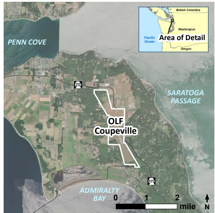
Figure 1 – OLF Coupeville

On April 26, 2024, the United States Environmental Protection Agency (EPA) issued a final National Primary Drinking Water Regulation (NPDWR) establishing nationwide drinking water standards for certain PFAS under the Safe Drinking Water Act. The regulation applies to public drinking water systems. Operators of public drinking water systems regulated by the NPDWR have five years to meet these standards. In September 2024, DoD published "Prioritization of Department of Defense Cleanup Actions to Implement the Federal Drinking Water Standards for Per- and Polyfluoroalkyl Substances under the Defense Environmental Restoration Program," which describes DoD's plans to incorporate the EPA's drinking water regulation into DoD's ongoing PFAS cleanups and prioritize actions to address private drinking water wells with the highest levels of PFAS from DoD activities. Table 1 shows the DoD Action Levels for PFAS in Private Drinking Water Wells.